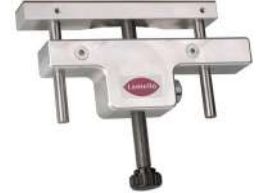
Cantex Guide Stop