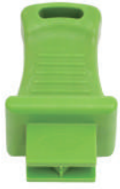
Tenso P-14 Preload Clip Tool - 145430