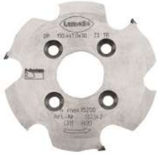
Zeta Clamex P-System Diamond Cutter - 132140