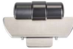
Divario Installation Tool 125500