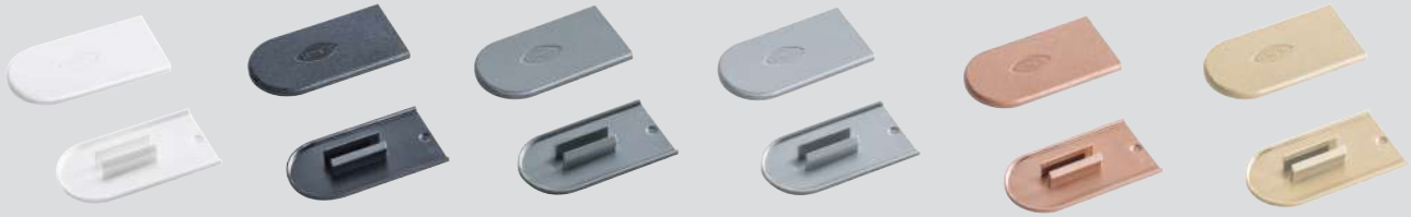
Pure White (W) Black (T) Dark Grey (A) Window Grey (F) Brown Beige (B) Ivory (H)