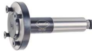
P-System CNC Arbor for CNC Cutter - 132150-153