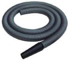
Dust Suction Hose