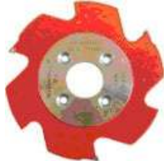
Zeta Clamex P-System Carbide Cutter - 132141