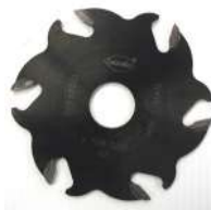
6 Tooth Carbide Cutter Classic Original