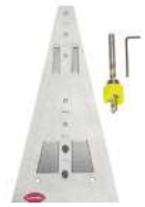
Divario P-18 Marking Jig 125510