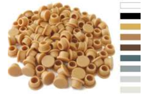
Clamex P 6mm Hole Caps 90° - 335280 - 335289